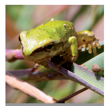
SARDINIAN TREE FROG

Large damselfly observable from May, dark spreadwing is easily distinguished by its green and blue coppery colors. Rare and threatened, it requires good quality wetlands to develop. It is also recognized as a good indicator of climate change and as such is one of the eighteen taxa of the National Action Plan "Odonata".