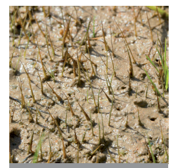
ΙΙ Ι.ΙΙ ΔΡΙΔ ΜΙΝΙΙΤΑ (Pilularia minuta)

The discovery of Pilularia minuta on the Tre Padule of Suartone, a first for Corsica, is at the origin of the recognition of the high floristic value of the site. A tiny amphibious plant of temporary ponds, characterized by its tracing rhizome and its filiform leaves, it is classified as a species in danger of extinction (EN) on the world and European red lists of the IUCN.