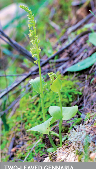
TWO-LEAVED GENNARIA (Gennaria diphylla)

Endemic to Corsica and Sardinia, this anuran with a smooth and green skin finds in the four ponds of the Tre Padule of Suartone a site favourable to its reproduction, notably by the absence of fish. Equipped with adhesive suckers, the tree frog spends most of its life on the ground, feeding on insects in the bushes and hibernating under a moss or in the hollow of a rock.